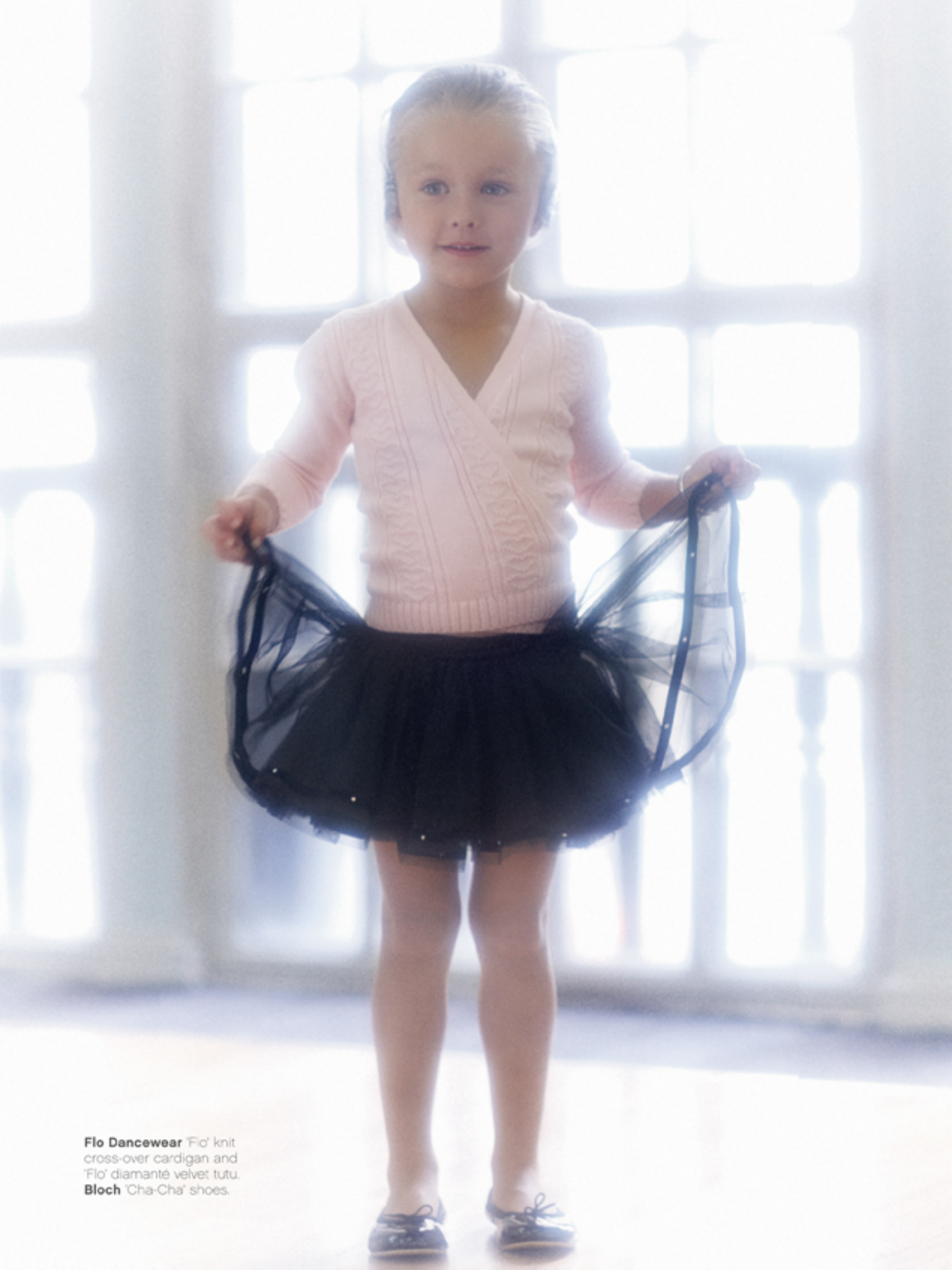
Flo Dancewear 'Flo' knit cross-over cardigan and 'Flo' diamanté velvet tutu. Bloch 'Cha-Cha' shoes.